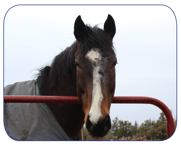
Elijah Off-Track Thoroughbred