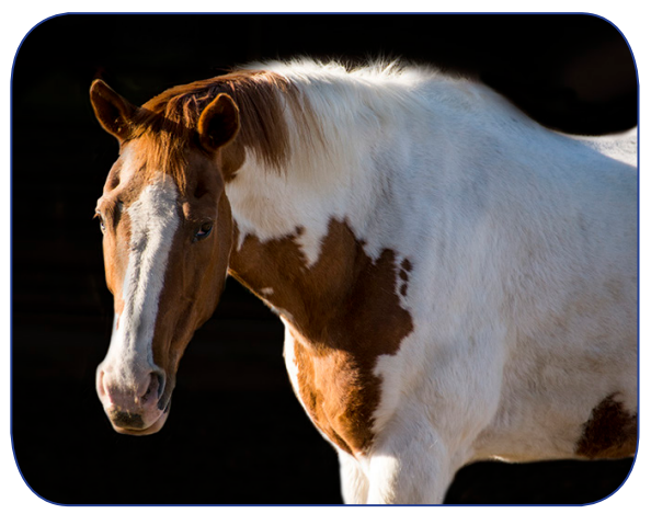
Today is the day of Gratitude

The attribute of gratitude contains the solution to the mysteries hidden in our problems. Feeling grateful is the strongest emotion that pulls us through all hardships and elevates our existence. Seeing the glass as half full instead of half empty is an ardent testament to our advancement.